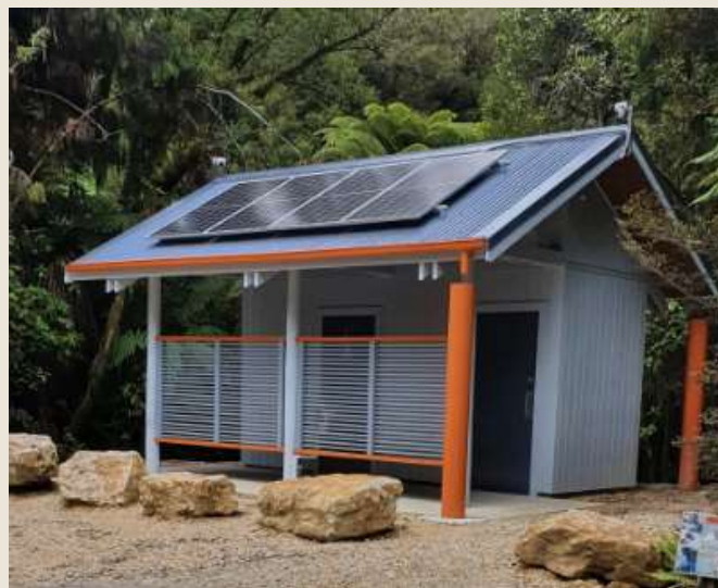
Figure 2- New toilet block Box Canyon car park showing security cameras

The new flush toilet in the Box Canyon carpark is fully completed and has been used since December 2020 with no concerns. The existing long drop toilet will be removed over the coming weeks and the path rehabilitated.