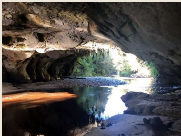
Figure 1: Moria Gate, Ōpārara Basin.

The Ōpārara Basin hosts a wide range of biodiversity including the short-tailed bat, whio/blue duck, Powelliphanta annectens , great-spotted kiwi, kaka, kakariki, Simplicia buchananii , Asplenium 'calcicole' , pukatea, the cave spider Spelungula cavernicolai and the silver fern.